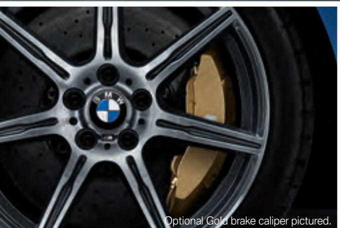
Optional Gold brake caliper pictured.