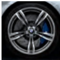
20" M Double-spoke style 343 M