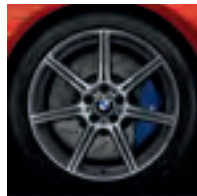
20" M Double-spoke style 601 M