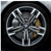
20" M Double-spoke style 433 M 6