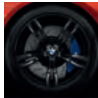
20" M Double-spoke style 343 M, Black